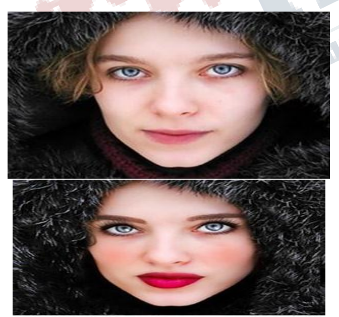
Fig.1. Example of Image Retouching

These features include image color, sharpness, brightness etc etc. Retouching is less harmful forgery technique when compared to the all other types at present. With the image retouching original image does not changes much, but it enhances or reduces certain feature of original image. This technique is popular among magazine photo editors. Even this technique is ethically wrong, while publishing a picture some features need to be enhanced. For this enhancement image retouching can be done.so this can be called as magazine publishing technique.