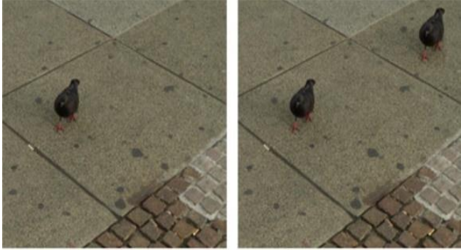
Fig.3. Example of Copy-Move attack

The copy move forgery is popular among the all other technique. This technique is most complicated technique. It is widely used tampering technique. In this technique, in order to add or remove information part of the image has to copy and move or has to cut and move. In the Copy-Move manipulation technique a part of the image is copied and pasted into another part of same image itself. In the copy and move attack, the intention is to hide something in the original image. For hiding the information that particular part of the image has to be masked with the copied region. The example of Copy-Move type is as shown in below figure 3 below. The original image contains only one pigeon and its Copy-Moved version on the right has two pigeons. This type of forgery detection is very crucial in the field of defense and legal documents.