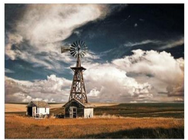
Fig.2. Example of Image splicing